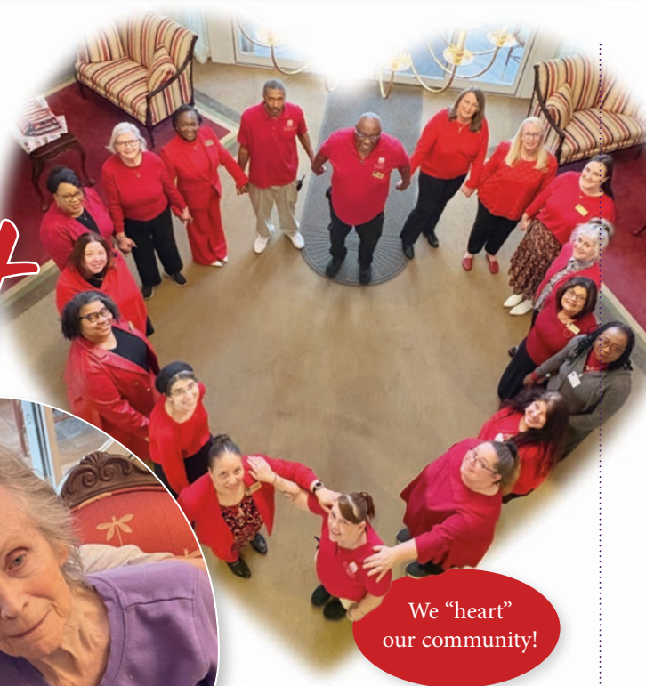
We "heart" our community!

On National Wear Red Day (February 6), the OLOP team formed a heart to help raise awareness of cardiovascular disease. Our team and residents continued to wear red every Friday in February to show our commitment to loving our hearts through healthy choices.