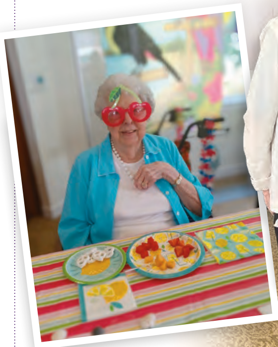
All eyes are on Dell as she sports the latest in summer fashion.